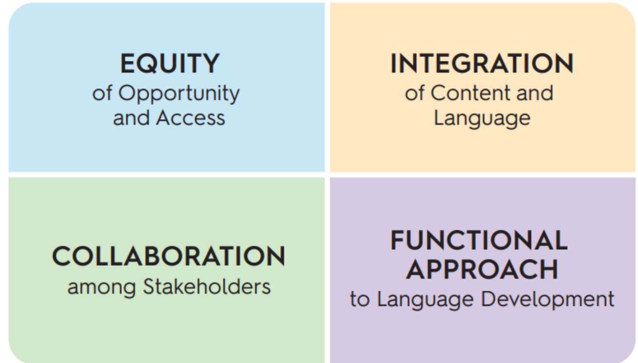
Figure F-1: Four Big Ideas in WIDA ELD Standards Framework, 2020 Edition